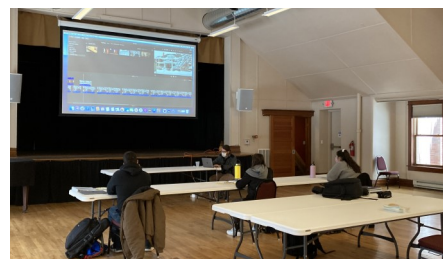
February training session