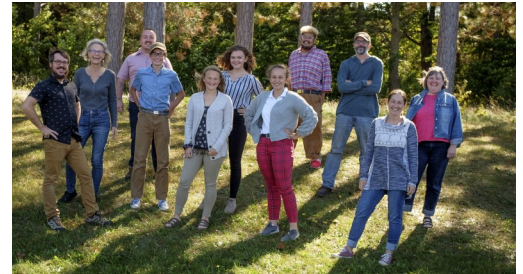
Project Coordinators and Year 1 interns.