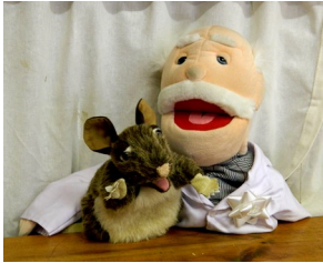
Boomer and Dr. Fizz

Dr. Fizz and Boomer, along with other BPL Puppet Lab friends traveled around our community looking for tales of tails. Each week they visited and interviewed neighbors who have interesting connections to animals so they could share exciting or funny stories about their animal friends.