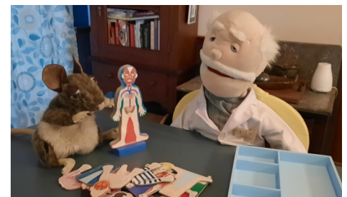
Boomer and Dr. Fizz learning about the human body.

Dr. Fizz and Boomer learned a lot about the human body. Now, when the librarian says "You two are getting on my nerves," they know what she's talking about and can quickly identify that system.