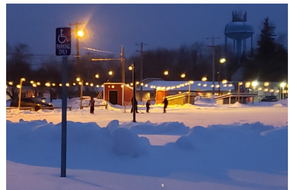
Academy Park ice rink in Benzonia.