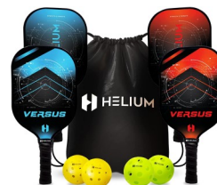
Pickle Ball Set