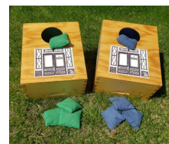
Bean Bag Toss

Details at BPL: 231-882-4111 or www.benzonialibrary.org/library-of-things