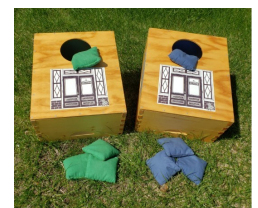
Bean Bag Toss