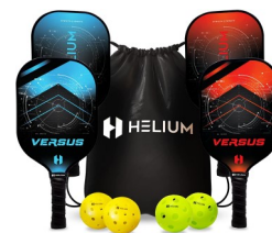
Pickle Ball Set