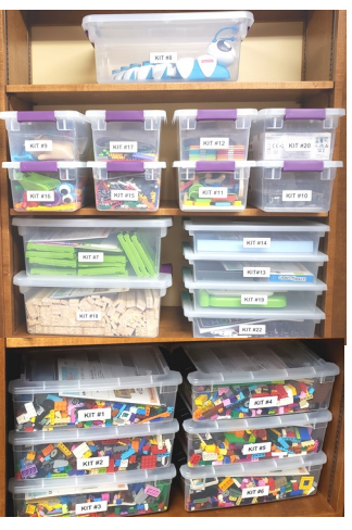
Kits ready for check out

Thanks to a collaborative effort between the Traverse Area District Library and Newton's Road, STEM kits are NOW AVAILABLE at Benzonia Public Library! The two organizations obtained a grant from the Institute of Museum and Library Services which will put STEM kits in all of the libraries in our region!