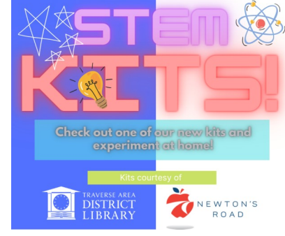
This project was made possible in part by the Institute of Museum and Library Services.

Many thanks to Traverse Area District Library and Newton's Road.