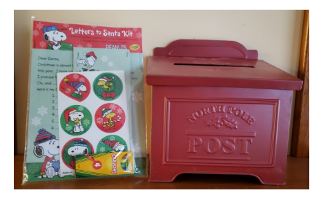
December craft kit & North Pole mailbox.

Kits are first come, 1st serve, but you can write your own letter to Santa at home with what you have. Just drop it in the drop box and we will make sure to get it to Santa!