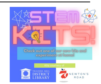
This project was made possible in part by the Institute of Museum and Library Services.