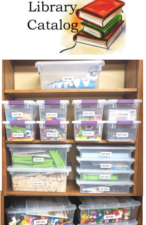
Kits ready for

Contact us at <u>benzonialibrayconnect@gmail.com</u> or 231-882-4111with questions.