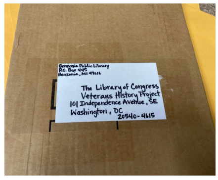
Veteran's History Project videos being sent to the Library of Congress.