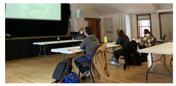
January training session

UPDATE ON YEAR ONE VIDEOS: All of the completed projects from our Year One interns are currently posted on the Remembering Benzie YouTube channel.