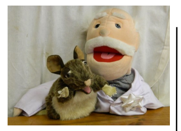
Boomer and Dr. Fizz

Join Dr. Fizz and Boomer, along with other BPL Puppet Lab friends, during the Summer Reading Program, as they travel around our community looking for tales of tails. Every week they will seek out and interview our neighbors who have interesting connections to animals, and can share exciting or funny stories about their animal friends. Who knows where they'll end up and what kind of adventures they'll have!