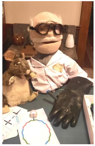
Boomer & Dr. Fizz, learn coding

Once you learn what Ozobots can do, you can go to the <u>Ozobot website</u> and get more games, or even learn how to code in Blockly language to program your own Ozobot (Yes, you can actually program your Ozobot by writing the code, then holding the robot up to the computer screen!).