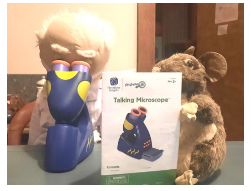
Dr. Fizz & Boomer enjoy learning about animals & plants

Introduce children to a real scientific toy that is easy to use and fun to learn with over 100 facts and questions. The real slides include 60 beautiful full-color images and 2 modes of play: Fact Mode and Quiz Mode. The talking microscope is the perfect STEM TOY to encourage an interest in biology, botany, technology and overall curiosity.