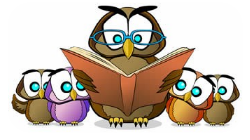
Another story, please!