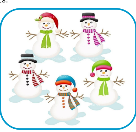
BPL staff, we're here for you!