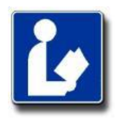
Benzonia Public Library