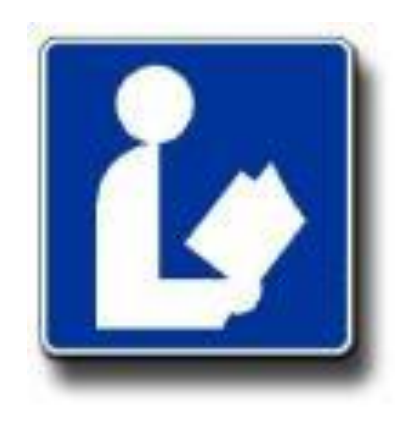
Benzonia Public Library